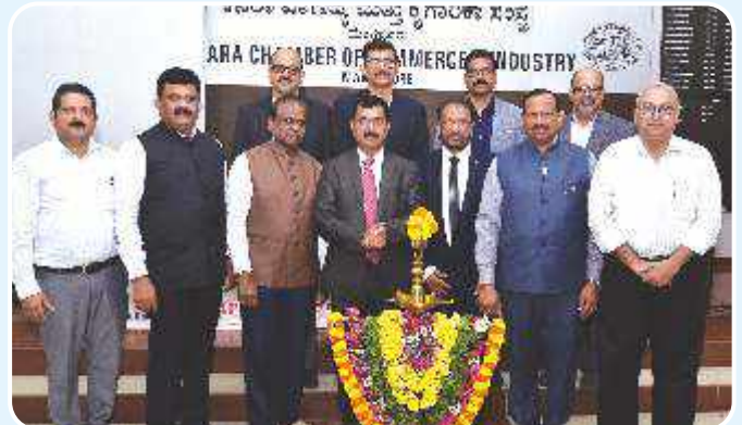
The dignitaries of FKCCI and KCCI after lighting the lamp on the occasion of the full day seminar on "APMC, GST and Other Industry Issues" organized on 23rd March 2019 at the Meeting Hall of KCCI