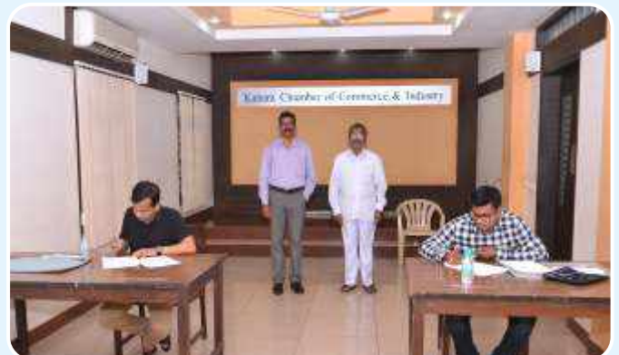
The Qualifying exam of the Institute of Chartered Shipbrokers was held at the KCCI on 13/05/2019