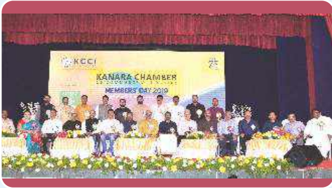
President, Office Bearers and Board of Directors with the Past Presidents on the occasion of Members' day Celebrations 2019 at St. Aloysius Loyola Hall on 03/03/2019.