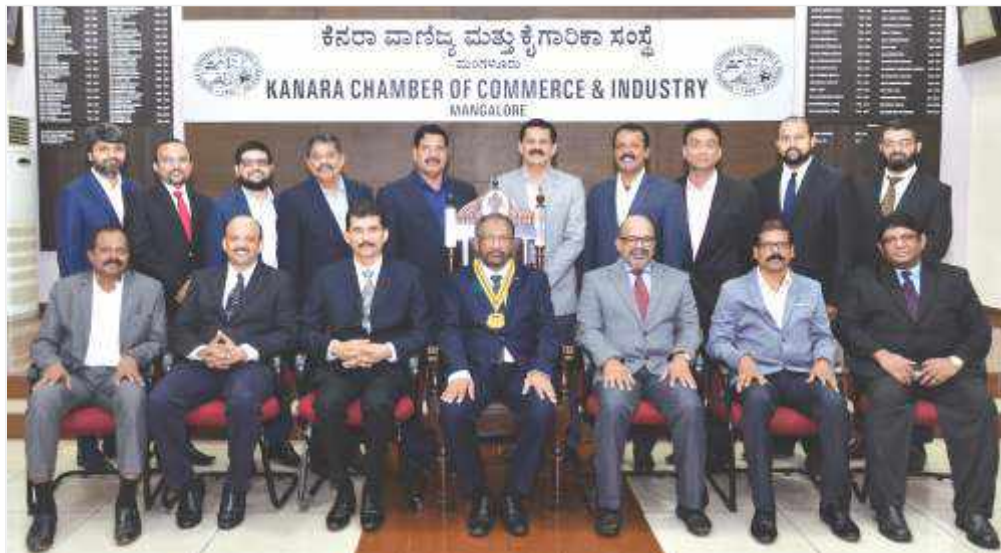
KCCI COMMITTEE / BOARD FOR THE YEAR 2018-19

"Chamber Building", Chamber Road, Bunder, P.B. No.116, Mangalore - 575 001 Tel: 0824 2420128, 2441859 & 4260128 Fax: 0824 2420669 Mobile: 94835 10669 Email: kanarachamber@gmail.com | Website: www.kanarachamber.com