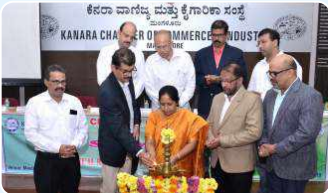
A programme on GST Annual return, GST Audit and Recent Amendments in GST was held on 27th February 2019 at the meeting hall of KCCI