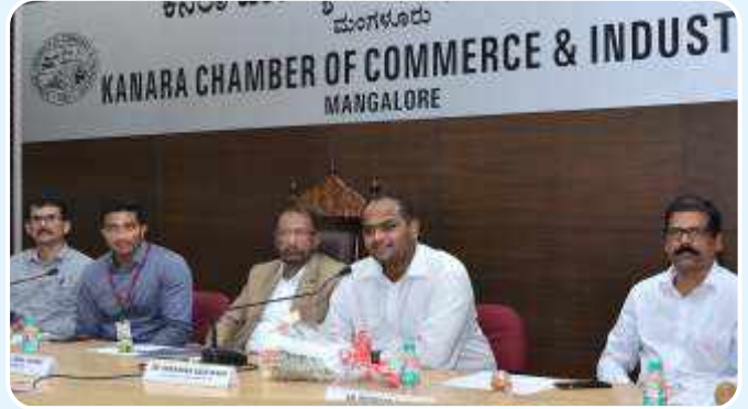
Awareness Session on 'SME Funding - Role of Capital Markets' & 'Mandatory Dematerialisation for Public Unlisted Limited Companies' at KCCI on 12-10-2018