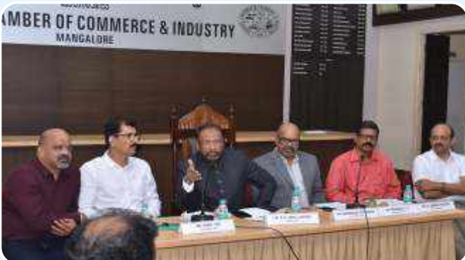
Press meet held on 30-10-2018 at the Meeting Hall of KCCI.